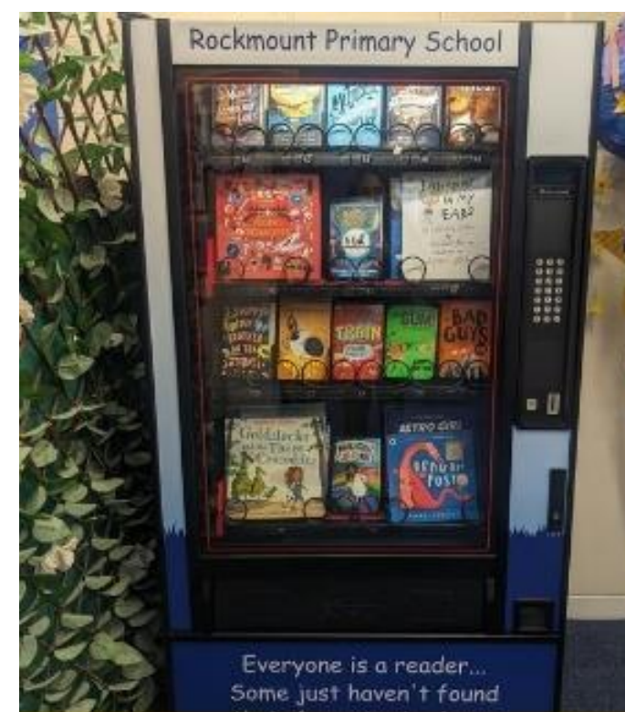
Book Vending Machine