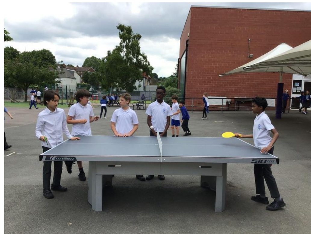
Table Tennis Tables