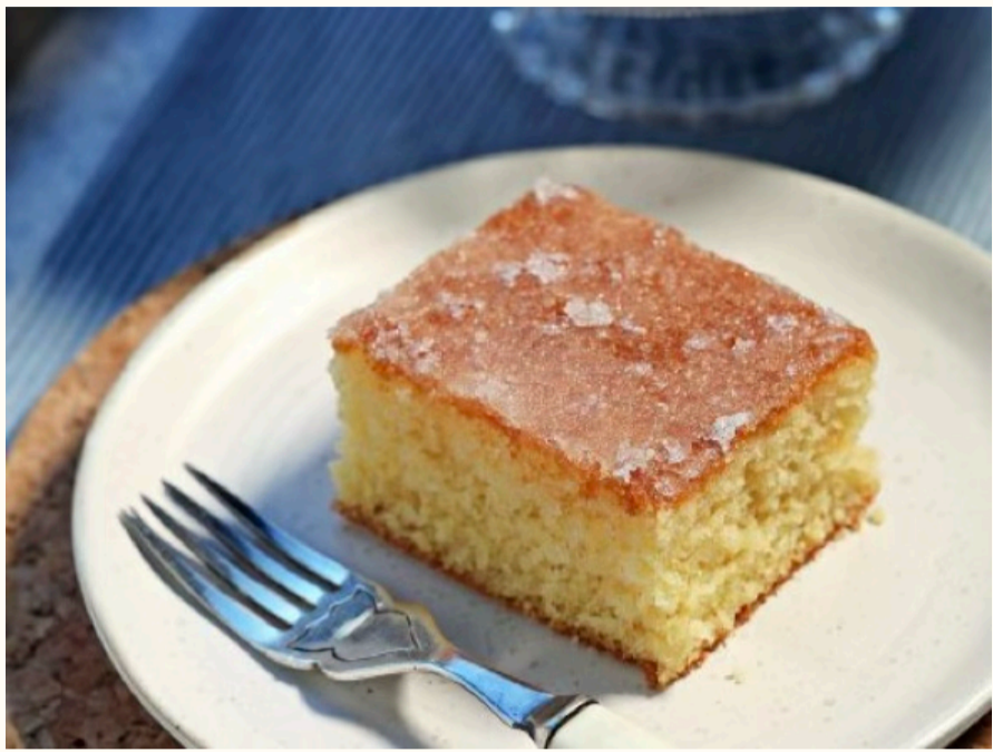
Jennie's Lemon Drizzle Cake

A cloud of citrus delight! This lemon sponge was so light and airy, it was like biting into a dream. The crispy sugar finish added just the right crunch — pure perfection.