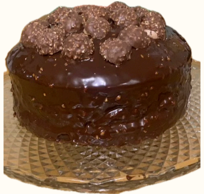
Sharon's Ferrero Rocher Chocolate Gateaux

A cloud of citrus delight! This lemon sponge was so light and airy, it was like biting into a dream. The crispy sugar finish added just the right crunch — pure perfection.