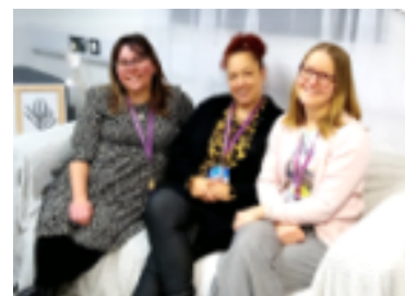
Emotional Literacy Support Assistants (ELSAs)