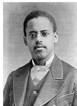
Lewis Latimer 1848-1928